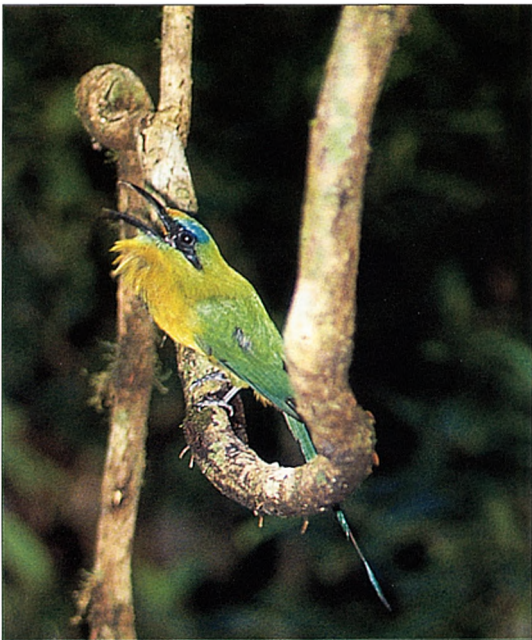
Male Keel-billed Motmot giving territorial call