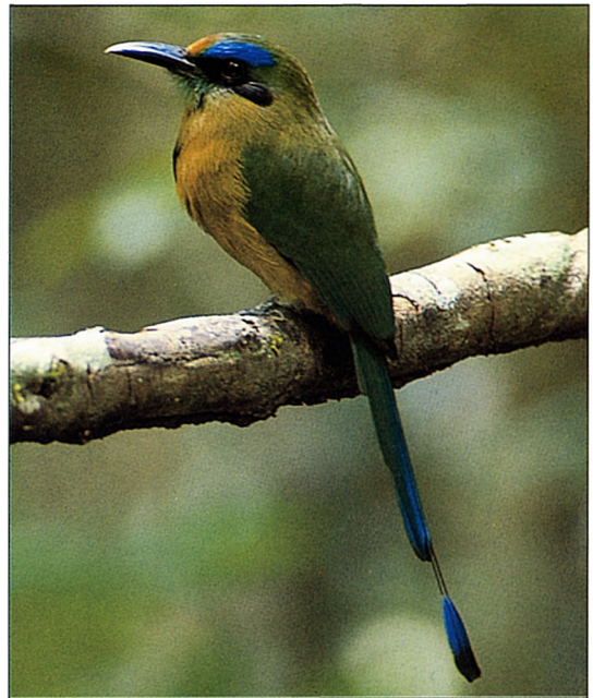
Keel-billed Motmot Electron carinatum