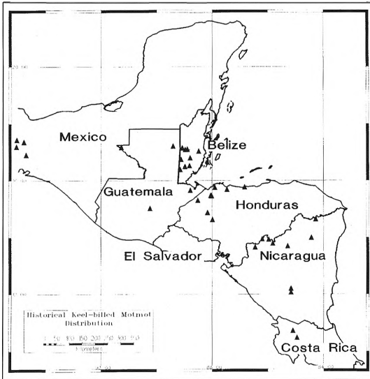
Map 1 Historical Keel-billed Motmot distribution