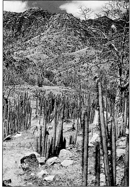
Habitat of Yellow-faced Parrotlet Forpus xanthops in the dry season, dominated by cacti (Alfredo J. Begazo).

The mortality rate between capture and the birds' sale on the domestic or international market is extremely high. In a study of mortality rates of the ten most popular bird species on Lima's wild animal market, F. coelestis exhibited the highest mortality rate 4 . Forpus sp. become extremely aggressive in conditions of overcrowding; birds fiercely bite each other's napes and the large round wounds which result may expose the victim's skull. Many individuals die as a result. In addition, stomach problems apparently caused by a sudden change in diet following capture also lead to a large numbers of deaths. During the same study the mortality rate of F. coelestis increased from 25% in birds fed with the same food after capture, to over 65% in birds fed with a different type of food following capture. Birds captured in sorghum fields and subsequently fed on sorghum exhibited a lower mortality rate than those dependent on a diet of wild seeds, and then fed with sorghum and other bird foods. However, in the case of F. xanthops this situation is exacerbated by the fact that the majority of birds are caught in areas where they feed on wild seeds. Long informal interviews with trap-