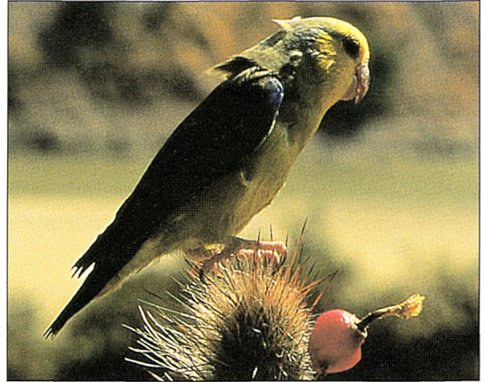
Male Yellow-faced Parrotlet Forpus xanthops feeding on Cereus sp..

Throughout its limited distribution along the upper Río Marañón valley, Forpus xanthops is found in arid desert scrub and cactus-prosopis desert 9,10 . In the area surveyed near Los Cocos, the species was found primarily above the riparian vegetation in a plant community dominated by cacti ( Cereus sp., Cephalocereus sp., Opuntia , Melocactus sp., Loxanthocereus sp.) and trees including Bromingua sp., Pitcarnia grandiflora , Deuterochoia longipetala , Capparis angulata , Sapindus saponaria , Cassia fistula and Cordia rotundifolia . During this survey, birds were observed perching in trees including Prosopis sp. within the riparian vegetation, although all foraging and feeding observations (principally in the morning and late afternoon) were in the cacti-