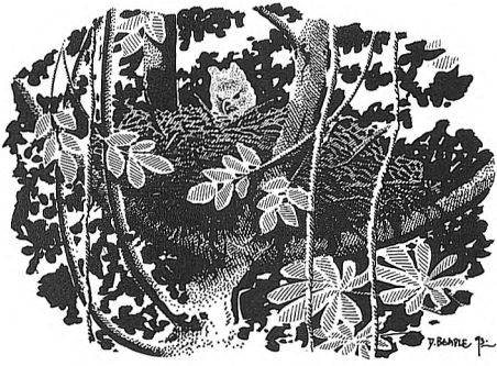
Harpy Eagle Harpia harpyja