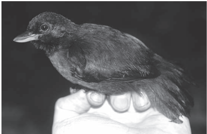
Figure 1. Female Black Bushbird Neotantes niger , Bahuaja Sonene National Park, Puno, Peru, September 2011 (Gabriel Jamie / Wildlife Conservation Society)

We believe our Cerro Cuchilla record represents a previously undocumented resident population within Bahuaja Sonene National Park and the Tambopata watershed. This population has gone undetected probably due to the species' skulking behaviour and lack of coverage. Our record is the southernmost of the species and the first for Puno. We hypothesise that its range could extend into Bolivia, where the species should be searched