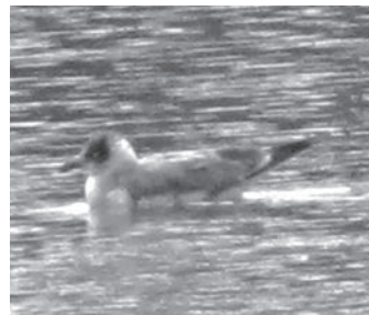
Figure 1. Franklin's Gull Leucophaeus pipixcan , Parque Simón Bolívar, Bogotá, Colombia, October 2011

In September 1997, TMD & LD observed several American Golden Plovers Pluvialis