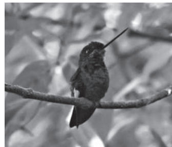
Figure 2. Buff-winged Starfrontlet Coeligena lutetiae , Clarita Botero, Ibagué, Colombia, January 2012 (Nick Athanas)

dominica and a Short-billed Dowitcher Limnodromus griseus at CIAT, between Palmira and Cali, dpto. Valle del Cauca (03°30'14"N 76°21'20"W), where a semi-flooded rice field attracted many migrant waders, including Pectoral Sandpiper Calidris melanotos and both yellowlegs Tringa spp. The dowitcher was studied carefully with a North American field guide at hand, but no photographs were obtained. Both species are rare migrants in Colombia. A juvenile Franklin's Gull Leucophaeus pipixcan was at Parque Simón Bolívar, Bogotá (04°39'26"N 74°05'42"W), in October 2011 (Fig. 1; TMD & MM) during a severe storm; there are very few previous inland records for Colombia and this is the first for the Bogotá region. A Buff-winged Starfrontlet Coeligena lutetiae was photographed (Fig. 2) on 26 January 2012 at 1,700 m at Clarita Botero, Ibagué (NA), an unusually low altitude (cf. McMullan et al. 2011: 2,800–3,700 m).