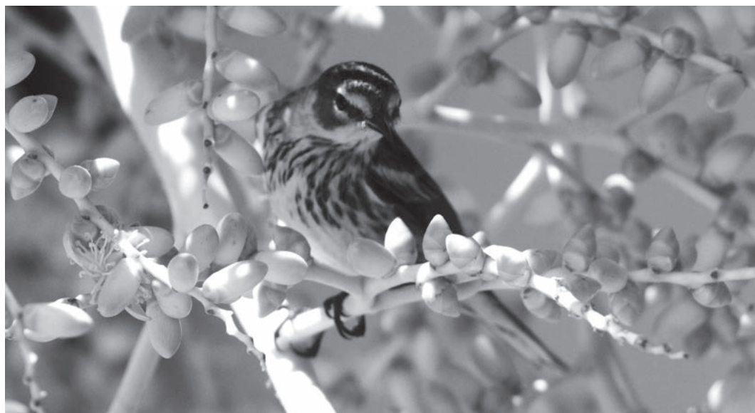
Figure 3. Cape May Warbler Setophaga tigrina , Scarborough, Tobago, April 2013 (Beth Ellis)

backed Gulls Larus fuscus in Havana on 28 February 2013, with one there on 16 March and three again on 17 March; and a Savannah Sparrow Passerculus sandwichensis in Parque Lenin, Havana, on 27 February 2013, with three there on 15 March.