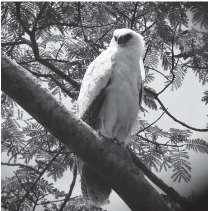
Figure 4. Juvenile Crested Eagle Morphnus guianensis in nest tree post-fledging, c.133 days old, 27 September 2007 (Anthony Crease)

the young for many hours, during consecutive full-day visits 81 and 99 days after estimated hatching, which behaviour has not previously been reported in the literature.