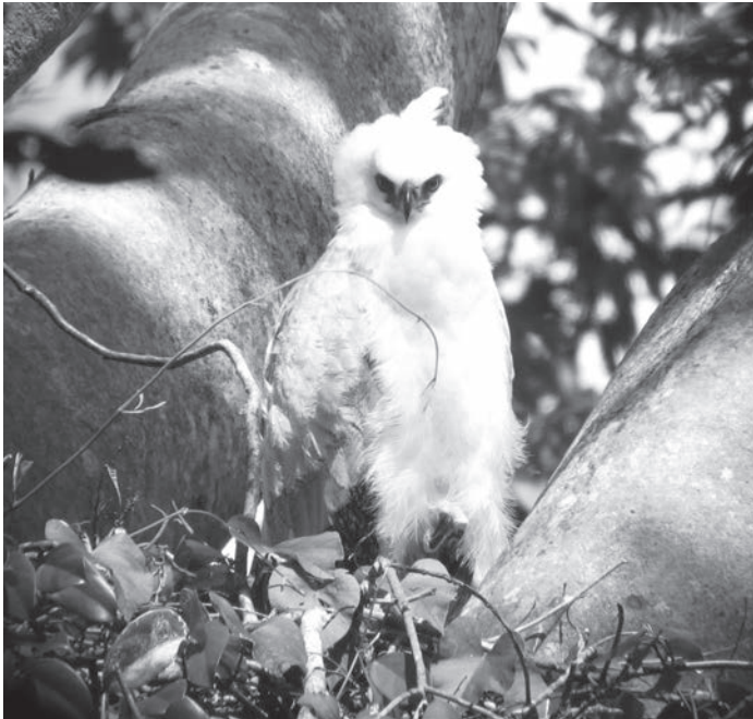
Figure 3. Unfledged young Crested Eagle Morphnus guianensis , c.105 days of age, 30 August 2011 (Anthony Crease)