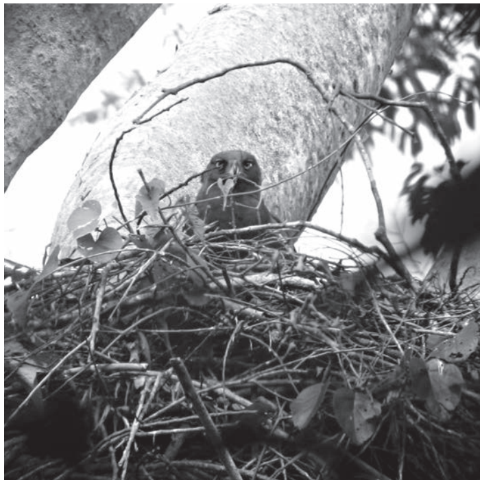
Figure 2. Female Crested Eagle Morphnus guianensis on nest, 30 June 2011 (Anthony Crease)