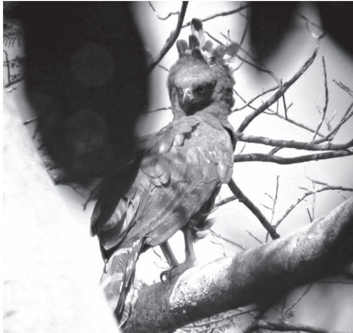
Figure 1. Female Crested Eagle Morphnus guianensis , 30 June 2011; note white crest feathers tipped black, and absence of barbules basally on the main crest feather; tail barring is pale greyish brown above and white below (Anthony Crease)

Development of the young and adult behaviour was otherwise similar to those in lowland Guatemala, with two exceptions. Firstly, the young appeared less excitable (e.g., less jumping during wing exercising and less reaction to over-flying vultures and other large birds) and secondly, and more significantly, we observed the female withhold food from