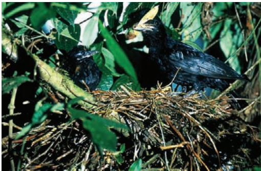
Figure 3. Adult female Long-wattled Umbrellabird Cephalopterus penduliger feeding 25-day-old nestling, Buenaventura, El Oro, Ecuador

to identify 172 items, the majority of which were invertebrates (Fig. 4). Invertebrate prey ( n = 146 ) included: 84 adult cicadas (Heteroptera, Cicadidae); 32 larval Lepidoptera; 14 katydids (Orthoptera, Tettigoniidae); nine adult Lepidoptera; three undetermined Orthoptera; one cockroach (Blattodea, Blaberidae, Blaberus sp.); one adult beetle (Coleoptera, Cerambycidae); one dobsonfly (Megaloptera, Corydalidae); and one unidentified arthropod. Vertebrate prey ( n = 22 ) included: 13 lizards (most appeared to be Iguanidae), six frogs and three snakes. The four fruits that were fed to the nestling appeared to be all of the same type: