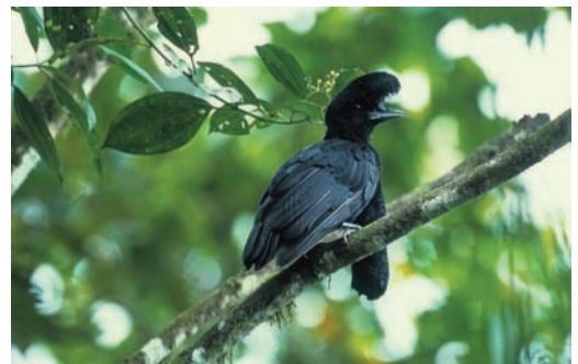
Figure 1. Adult male Long-wattled Umbrellabird Cephalopterus penduliger , Buenaventura, El Oro, Ecuador

We recorded a total of 342 feeding visits by the adult female (Fig 3). Of these, we were able