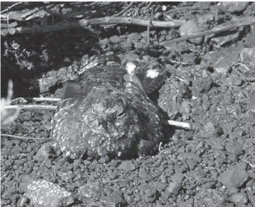
Figure 5. Female Band-winged Nightjar Caprimulgus longirostris performing (broken-wing) distraction display, Serra do Rola Moça State Park, Minas Gerais, Brazil, 14 November 2007