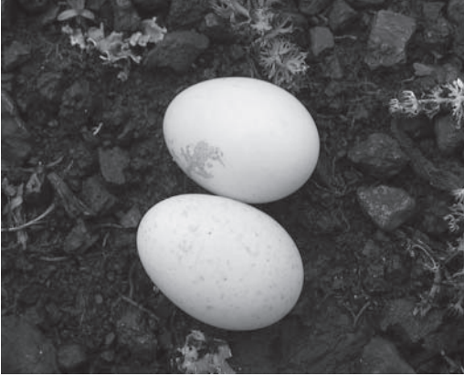
Figure 3. Eggs of Band-winged Nightjar Caprimulgus longirostris , Serra do Rola Moça State Park, Minas Gerais, Brazil, 26 September 2005