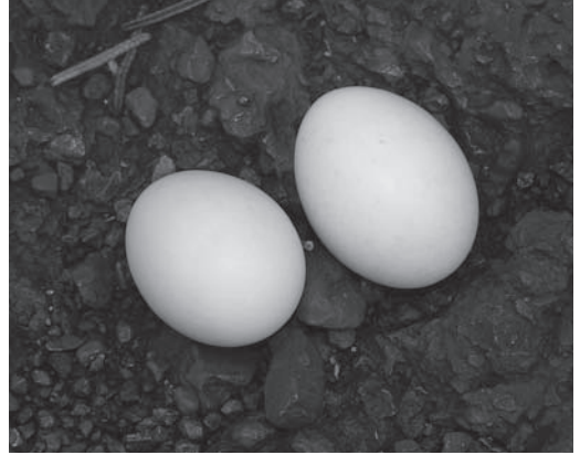
Figure 4. Eggs of Band-winged Nightjar Caprimulgus longirostris , Serra do Rola Moça State Park, Minas Gerais, Brazil, 5 November 2007 (Diego Hoffmann)