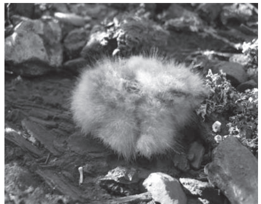
Figure 2. Chick of Band-winged Nightjar Caprimulgus longirostris , Serra do Rola Moça State Park, Minas Gerais, Brazil, 12 September 2005