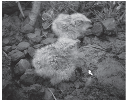
Figure 8. Chicks of Band-winged Nightjar Caprimulgus longirostris , Serra do Caraça, Minas Gerais, Brazil, 3 October 2009 (Ariana Dias Epifânio)