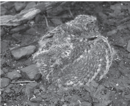
Figure 7. Young Band-winged Nightjars Caprimulgus longirostris, Serra do Rola Moça State Park, Minas Gerais, Brazil, 26 November 2007