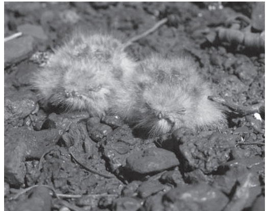
Figure 6. Chicks of Band-winged Nightjar Caprimulgus longirostris , Serra do Rola Moça State Park, Minas Gerais, Brazil, 14 November 2007