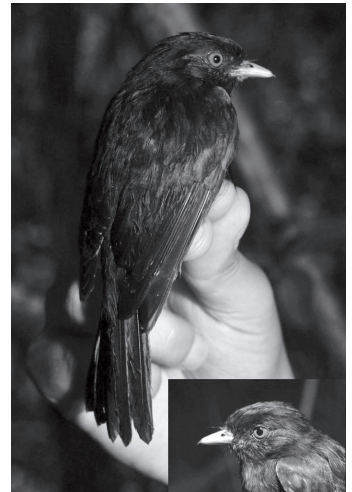
Figure 1. Male Blue-billed Black Tyrant Knipolegus cyanirostris mist-netted in the municipality of Catalão, south-east Goiás, Brazil, 10 August 2008

During regional surveys of the Serra do Facão Hydroelectric Dam, in the rio São Marcos basin, in south-east Goiás, we twice found individuals of K. cyanirostris . Vegetation is typical of the Cerrado, with a mosaic of dry forest and gallery forest, savanna ( cerrado sensu stricto ) and grasslands ( campo sujo and campo limpo ), as well as pastures and plantations (especially soya, bean and Eucalyptus ), bogs, rivers and degraded areas. Description of the