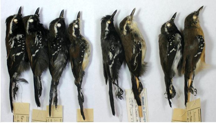
Figure 1. Specimens of Formicivora spp. From left to right: two male Serra Antwren F. serrana from Poté (MZUSP pending numbers, field numbers MG31 and MG37); male and female F. serrana from Almenara (MZUSP pending numbers, field numbers BA10 and BA09); male and female Black-bellied Antwren F. melanogaster (MZUSP 77742, MZUSP 81853); and male and female White-fringed Antwren F. grisea (MZUSP 83868, MZUSP 83423).