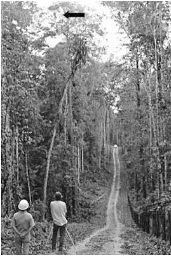
Figure 1. Track and trees in western Porto Seguro Reserve, Bahia, Brazil, 11 October 1986; sitting female Banded Cotinga Cotinga maculata indicated (L. P. Gonzaga)