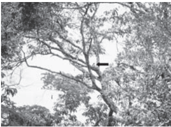
Figure 2. Telephoto view of female Banded Cotinga Cotinga maculata on nest, Porto Seguro Reserve, Bahia, Brazil, 11 October 1986

almost horizontal branch in the mid-canopy of a fairly tall tree in leaf (Fig.1). The female was first observed chasing away another female in some nearby trees; she moved to trees nearer the nest and fed rather hastily on a few berries, then flew directly to the nest and commenced incubating (Fig. 2). She was off the nest when we passed it at 11h30. Next day we visited the site in the mid-afternoon, and although the female was initially off the nest she returned within a few minutes and was examined through a