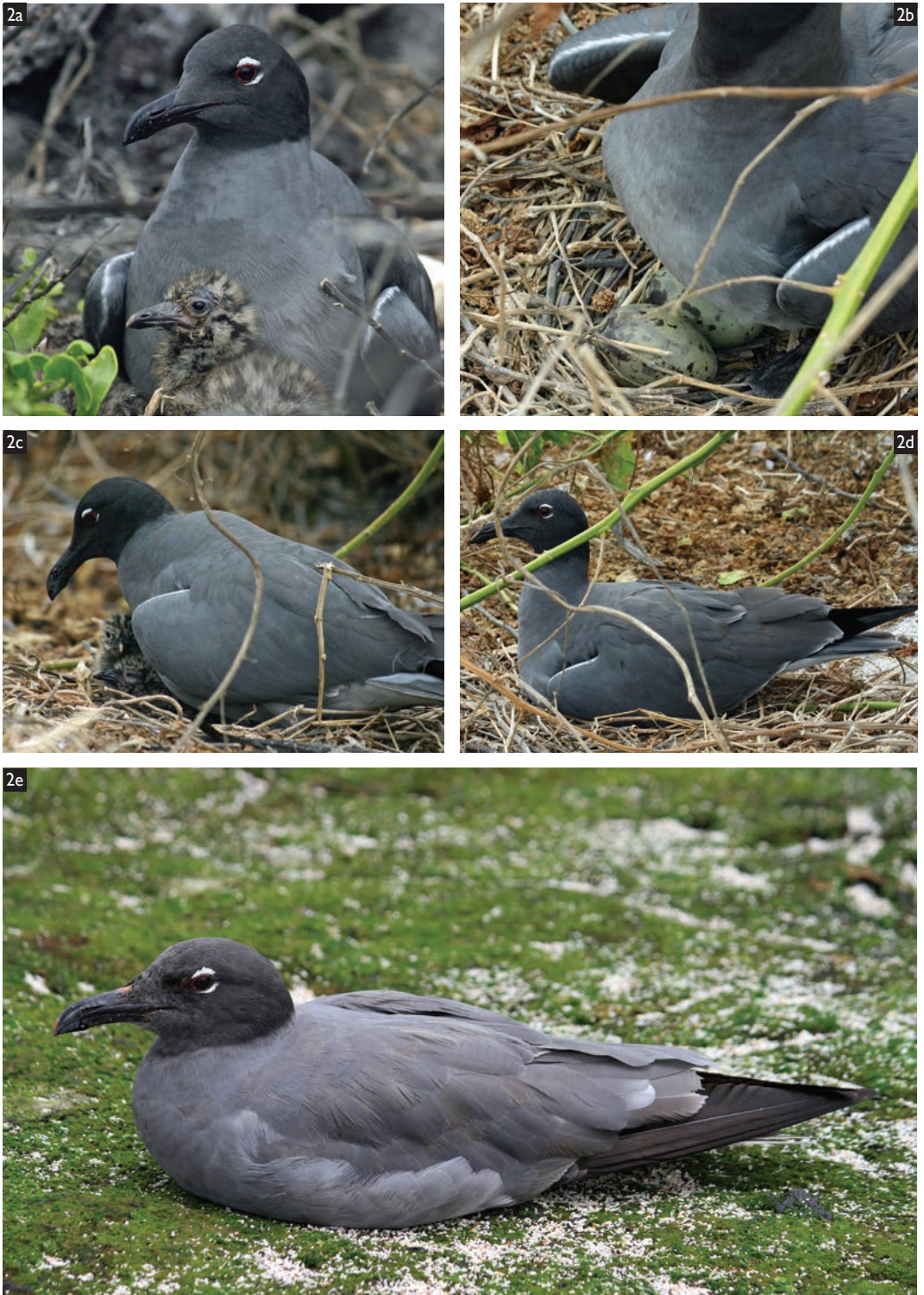
Figure 2. The white line along the curve of the wing contrasts against the dark plumage of the adult gull. It is visible when gulls are incubating, and can help distinguish nesting gulls (above) from resting gulls (bottom) (K. Thalia Grant)