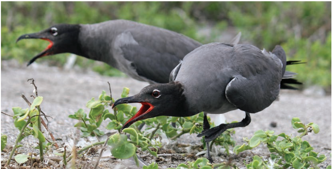
Figure 1. A pair of Lava Gulls Leucophaeus fuliginosus defending their territory

Local distribution and population numbers. —In order of decreasing densities, Lava Gull was found on beaches on the west coast, east coast, within