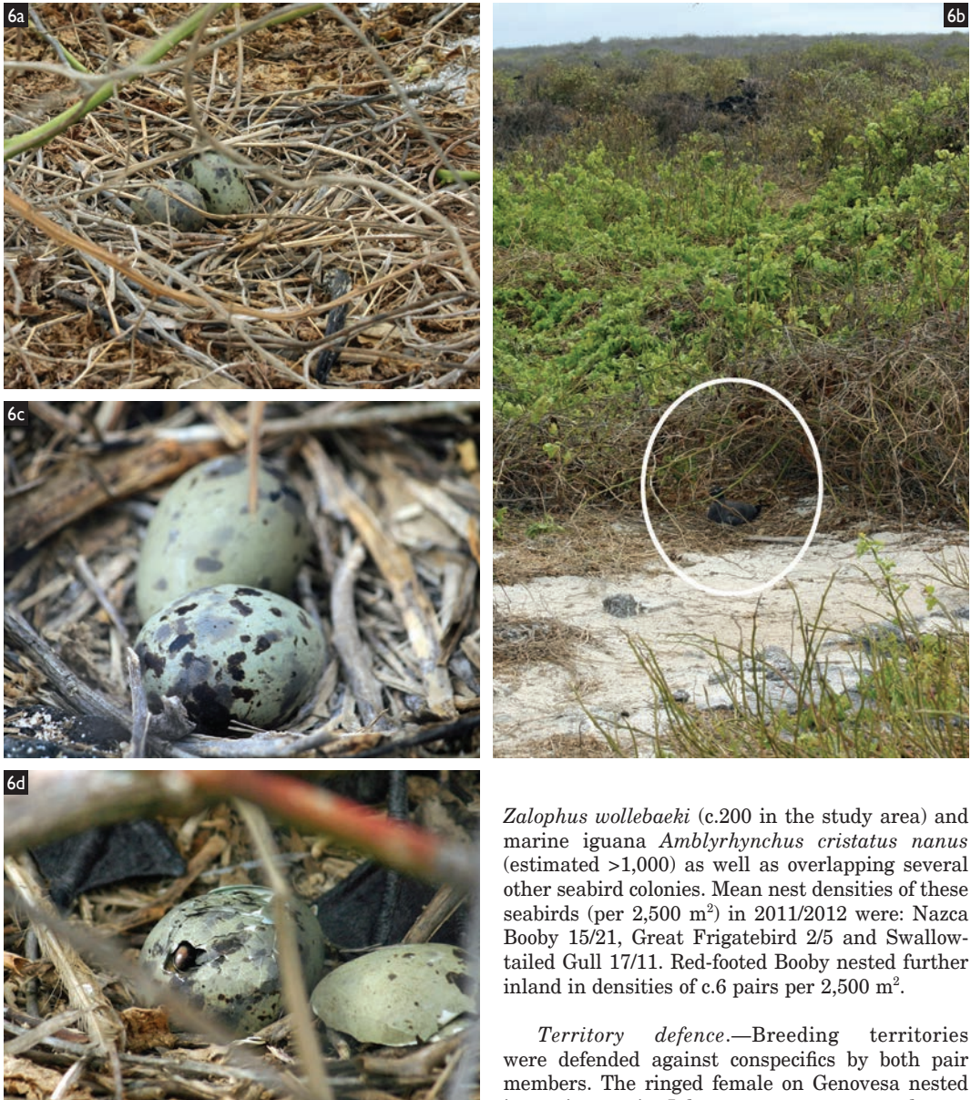
Figure 6. A Lava Gull Leucophaeus fuliginosus nest with eggs, including pipping egg (6d)

6 we recorded nesting in multiple years, although nest sites were never reused, and new nests were located 4–30 m from previous nests.