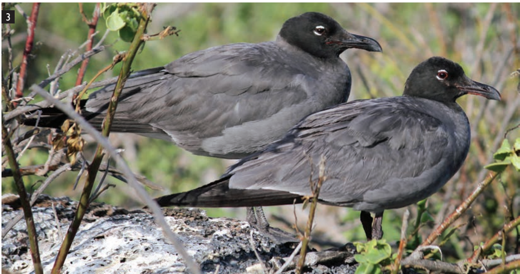
Figure 3. A pair of breeding Lava Gulls Leucophaeus fuliginosus ; the female is closest to the camera (K. Thalia Grant)