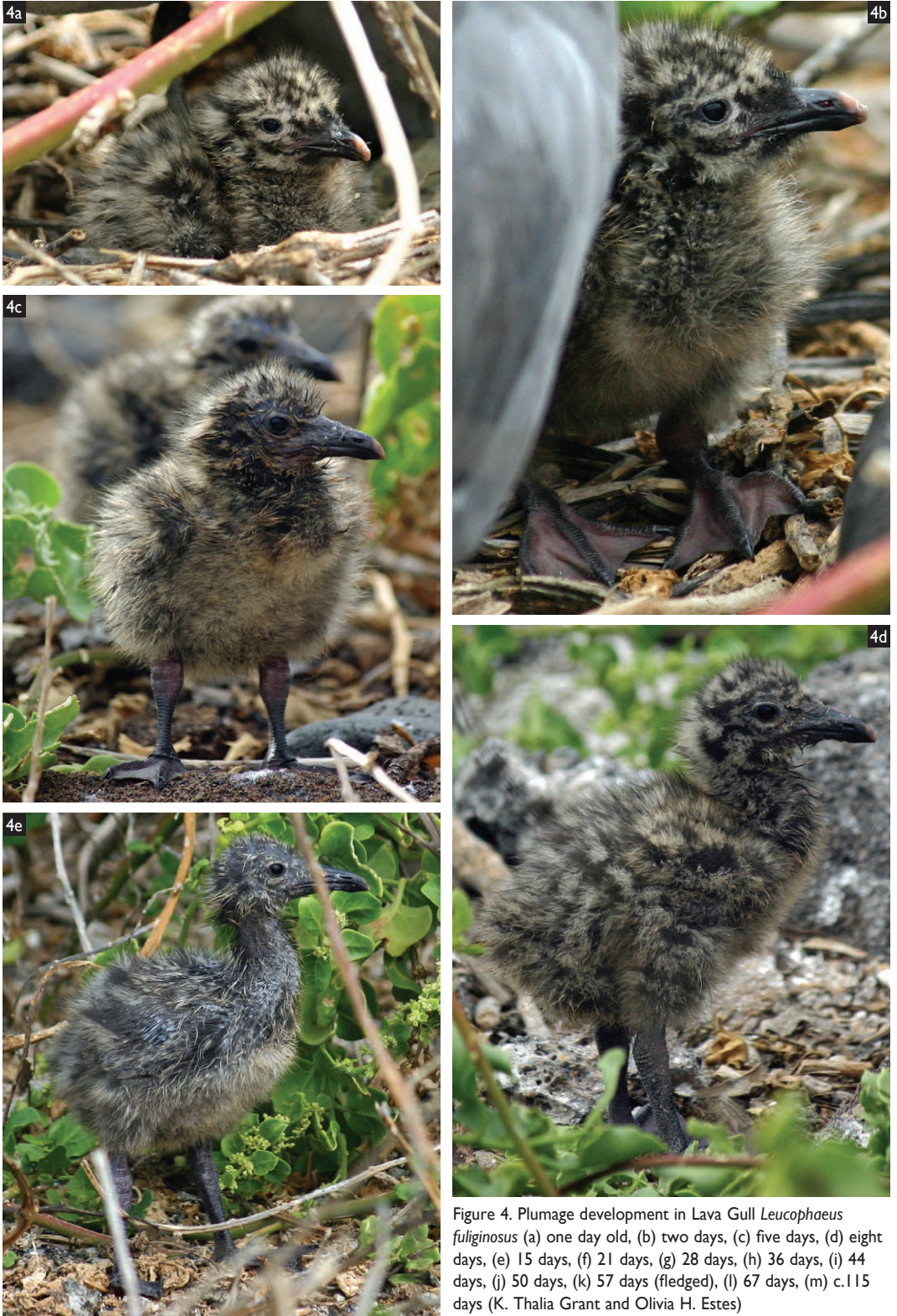
Figure 4. Plumage development in Lava Gull Leucophaeus fuliginosus (a) one day old, (b) two days, (c) five days, (d) eight days, (e) 15 days, (f) 21 days, (g) 28 days, (h) 36 days, (i) 44 days, (j) 50 days, (k) 57 days (fledged), (l) 67 days, (m) c.115 days (K. Thalia Grant and Olivia H. Estes)